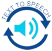
Text to Speech