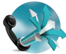
Mini CRM integration