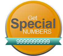
Vanity & Toll-free numbers